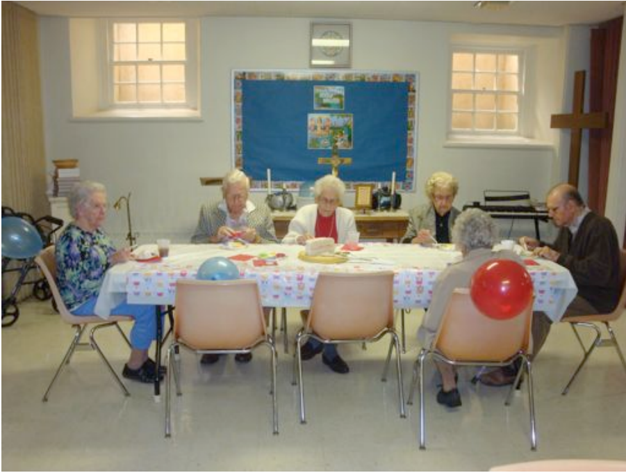
Some of the other party attendees