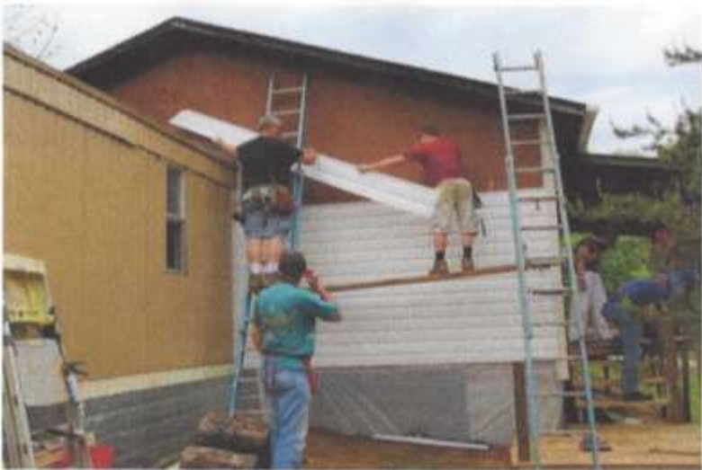
Helping Hands in David, Kentucky

Speaking of Mission, Trinity's last mission trip was featured in the April issues of Synod News.